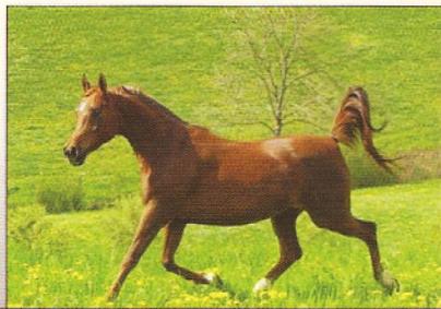
Graziella (Gips x Gwozdika).