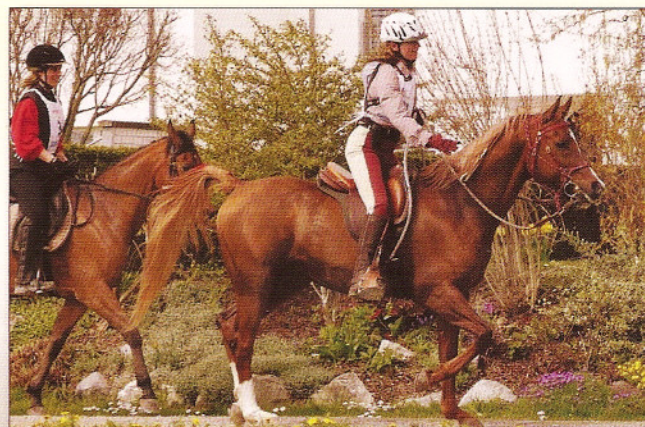
Bajkal on the way to win a 70km endurance ride.