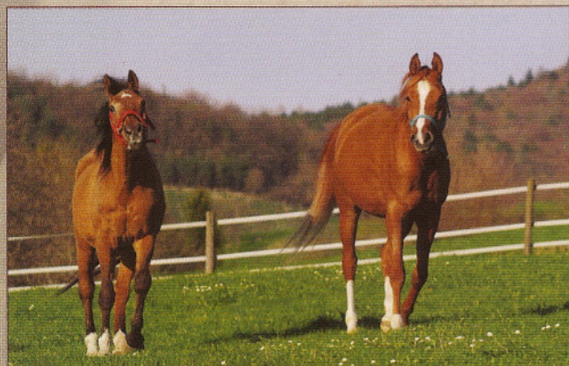
31 year old Scindian (Shah Jehan x Winged Hour) with his five-year-old girlfriend Popitka (Pobeditel x Rishah).