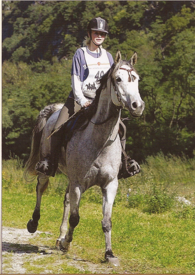
Kashan (Karat x Rishah) at an endurance ride.