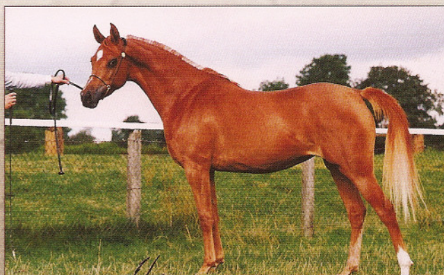
Rishah (Rihan x Jezabel) placed fourth at 1988 European Championships.