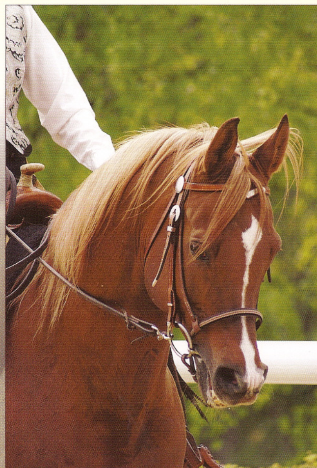
A head shot of the stallion Bajkal.

Mare. That victory was followed by several other top placings and reserve champion titles. In 2006, Rishah was also posthumously awarded the title of Elite Mare by the Swiss Arabian Horse Society. She left eight foals