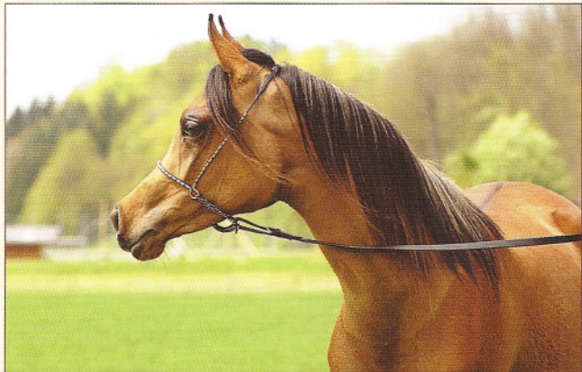
Baheera (Bajkal x Evelina).

outstanding foals such as the lovely Balinka, a charismatic and typey mare with a very feminine expression. She has been Gold Premium mare four times with the highest scores at the National Stock Show and a class winner as well as International Reserve Senior Female