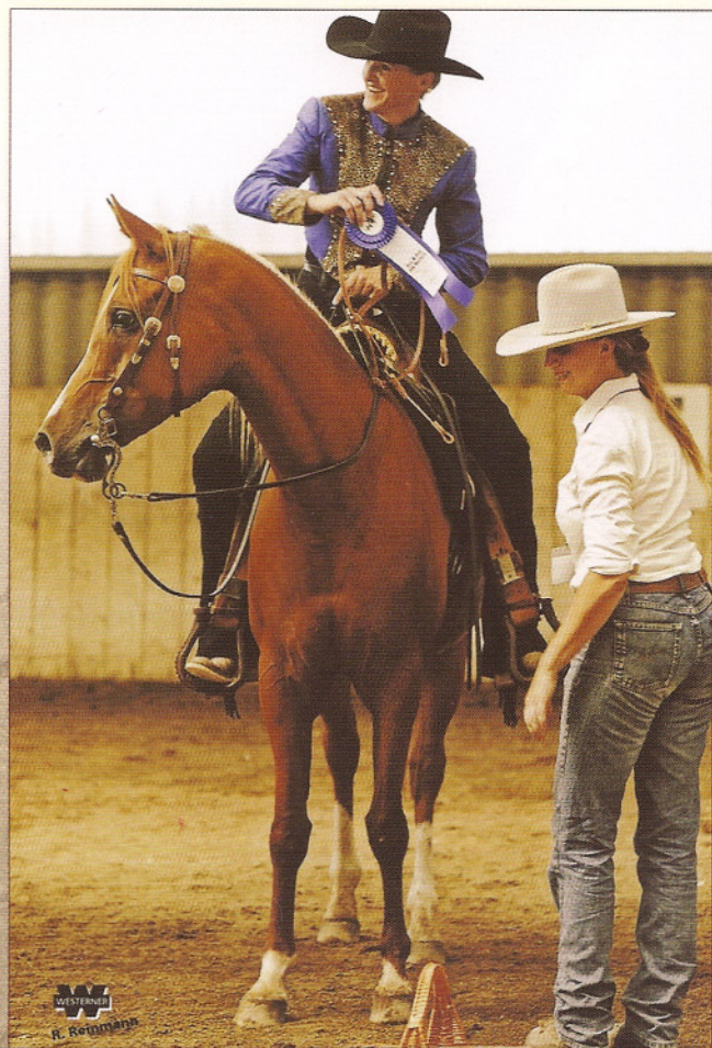
Danajah (Dinar x Rishah) wins a blue ribbon.