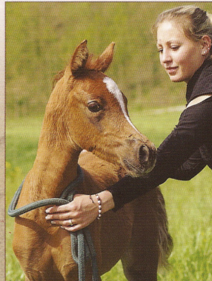
Shir Khan (Aja Shakakhan x Gaziella).