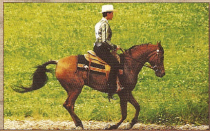
Evelina (Esplendor x Verba).