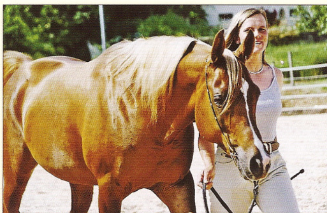
Breeding stallion Bajkal (Balaton x Rishah).

Hanaya Arabians. Rishah was shown as a two year old for the first time in Frauenfeld, Switzerland, where she won her class and became National Reserve Junior Champion